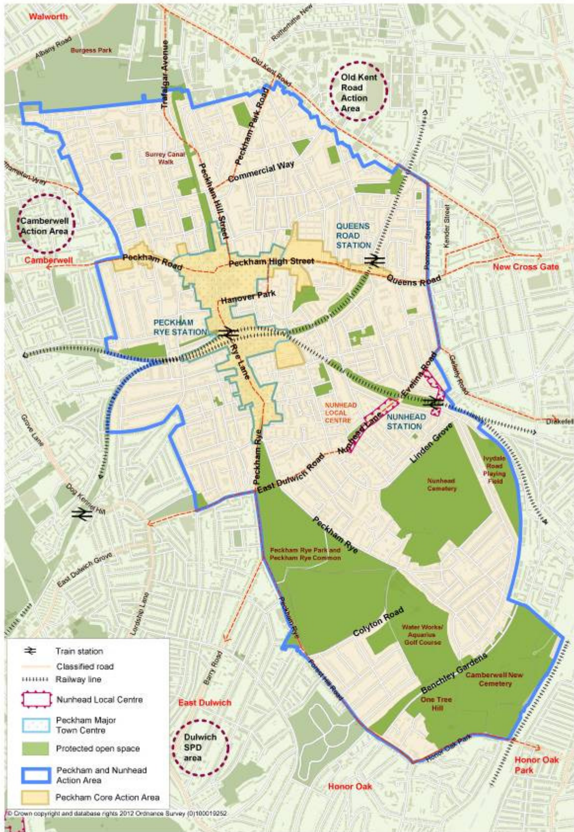
Figure 2: Area covered by the Peckham and Nunhead AAP